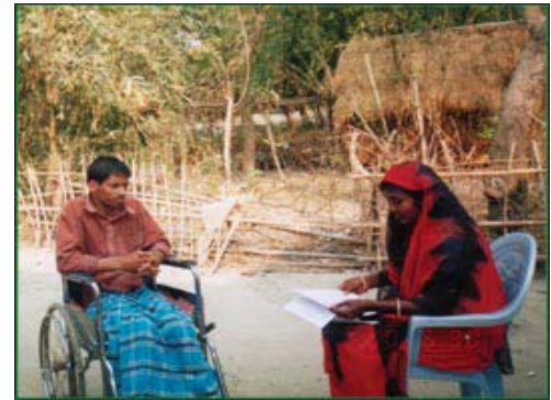
Door to door survey in being conducted