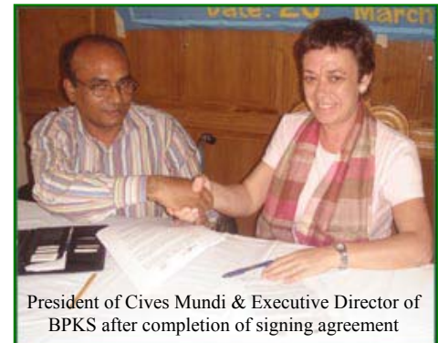
President of Cives Mundi & Executive Director of BPKS after completion of signing agreement

Signing of the agreement is a symbol of mutual partnership and friendly relationship between Cives Mundi and BPKS. It also reflects the commitment of both the parties for the establishment of right-based society for all through PSID Endeavours